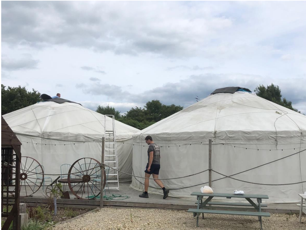
Photos 2-5: Sound proofing being inserted into the cover of The Salix Yurts in April 2019.